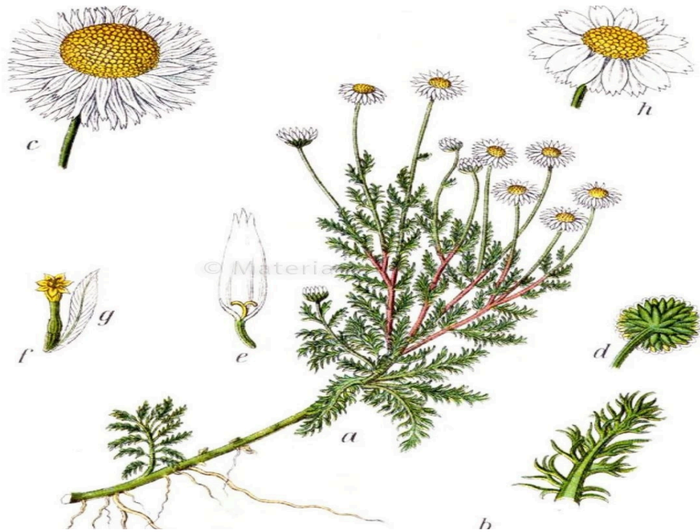
2.1 This image depicts a botanical illustration of the German Chamomile plant

Therapeutic Properties: Reduces inflammatory mediators (TNF- \alpha , IL-6) and inhibits Th17 cell differentiation during eczema. Promotes wound healing and repairs skin barrier. Used topically for anti-itch, anti-inflammatory, sun protection, and antiviral purposes. Bioactive compounds include chamazulene (anti-inflammatory), \alpha -bisabolol (wound healing, antimicrobial), apigenin (antioxidant), and flavonoids such as luteolin and quercetin (anti-allergic, antioxidant).