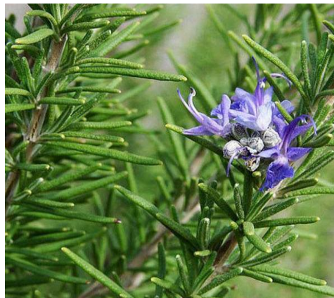
Rosemary - Herb Seeds